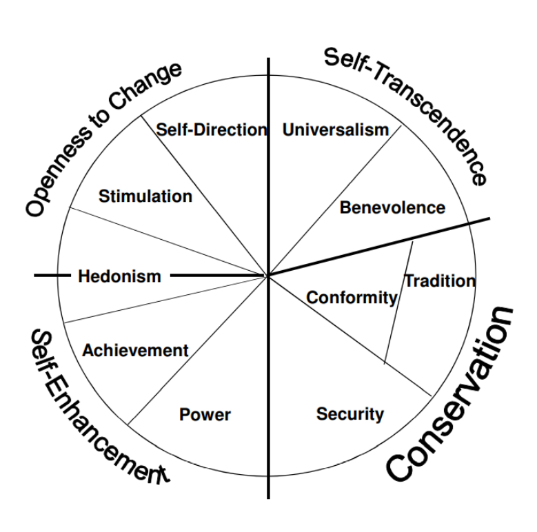
Figure 1. Ten basic values and theoretical model of relations among them (Schwartz, 1992)

According to values theory there are ten basic values, however, this can also be presented as a continuum of value motivations that are related to each other and this continuum makes it possible to represent structure of the values in a circular pattern. The shared motivational bases of adjacent values were used to explain the continuum.