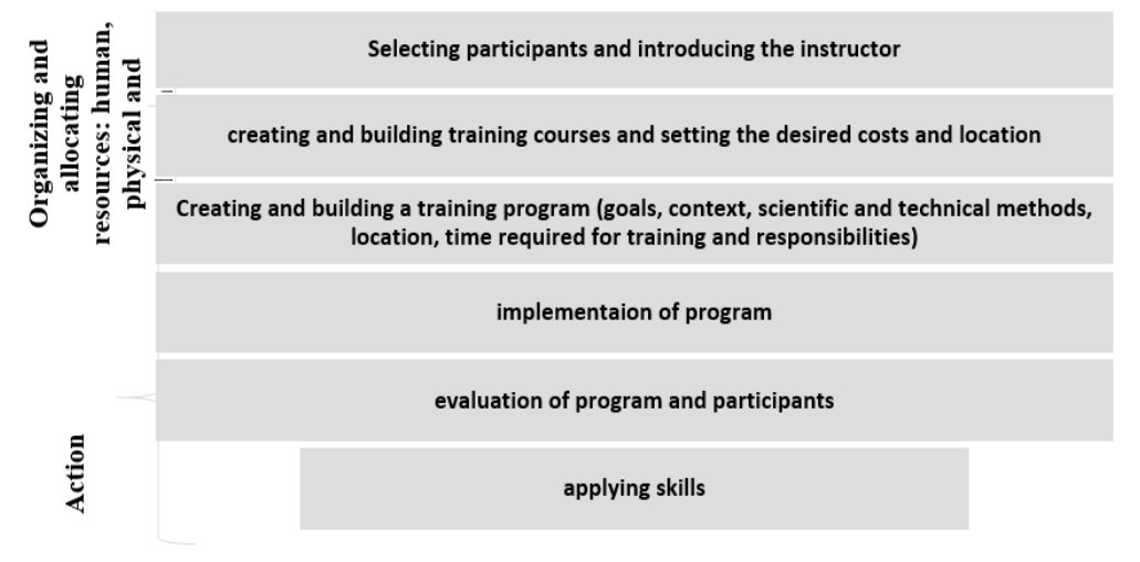
Figure 2. Human resource training risk framework (Rotărescu, 2011)

There are several steps to develop training program based on the process model: