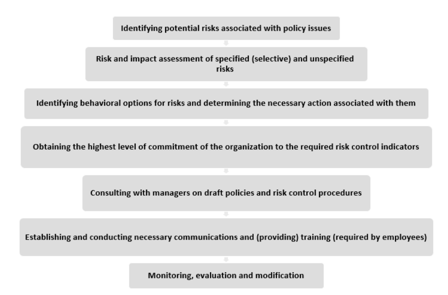
Figure 3. Steps of human resource risk steps and procedures (Stevens, 2015)